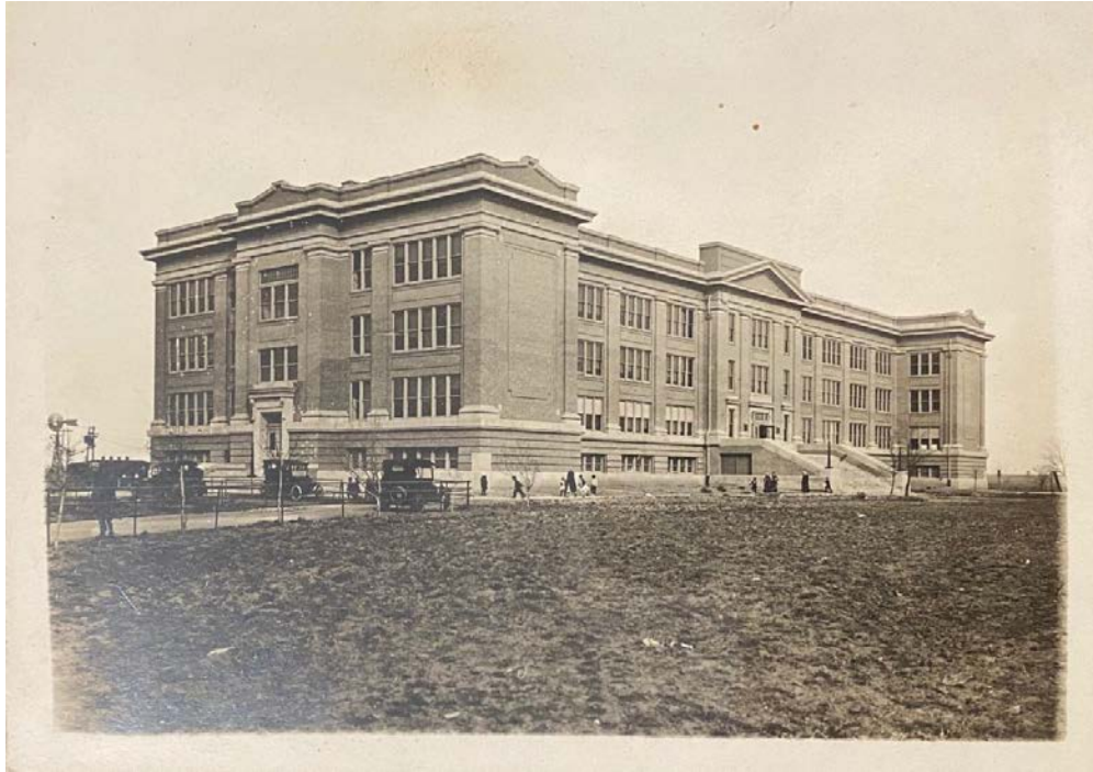
Old Main Then