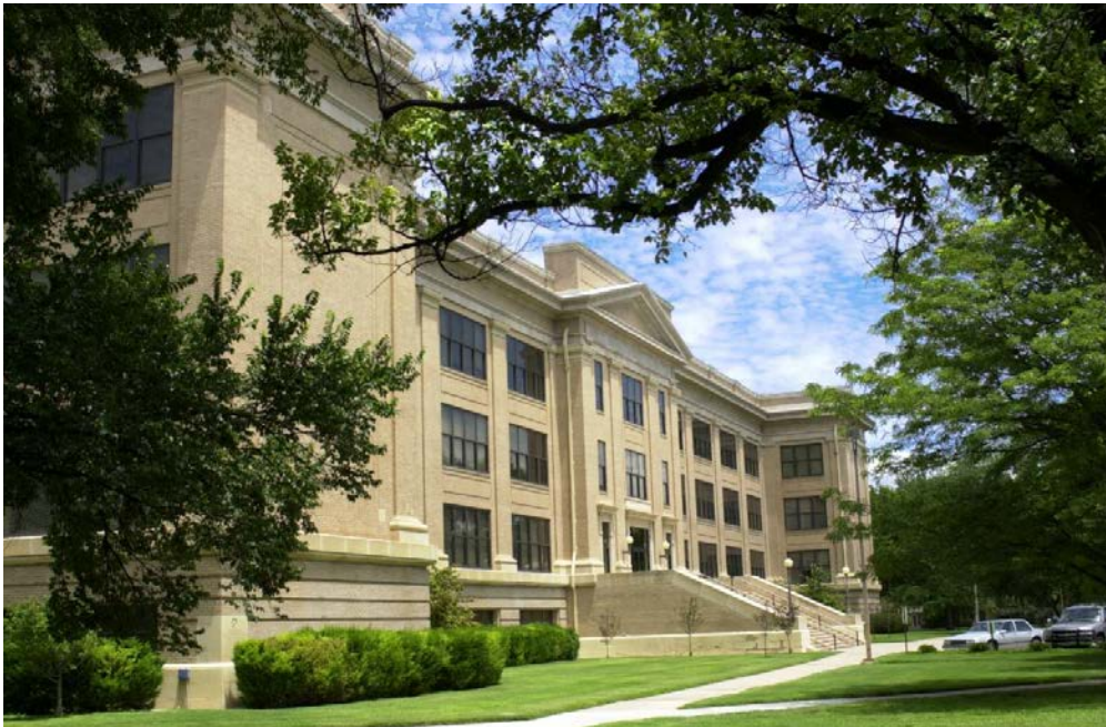
Old Main Now